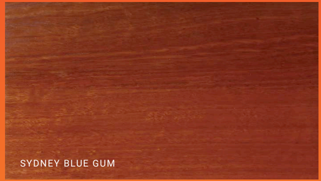
SYDNEY BLUE GUM